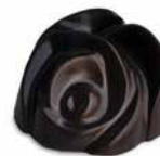
Rose Petal Passionfruit