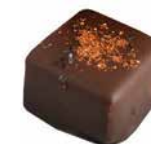
Smoke & Spice