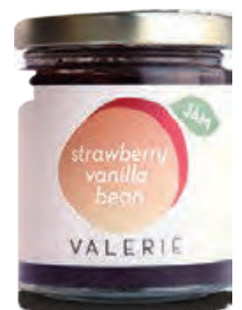
Strawberry Vanilla Bean